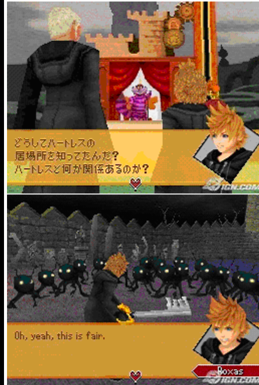
(Kingdom Hearts, from ign.com) (This is from two separate scenes)