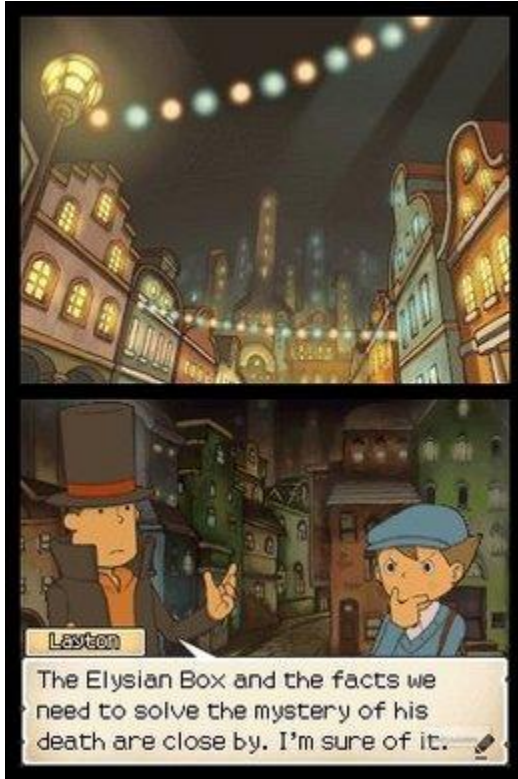
(Professor Layton, from eurogamer.net) (This is one screenshot)